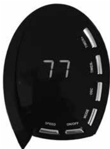
On/Off Speed Control