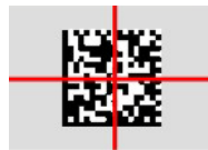
Relative Size and Location of Aiming System Pattern