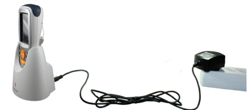
With Single Slot Dock