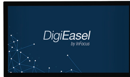
DigiEasel works in either portrait or landscape mode.