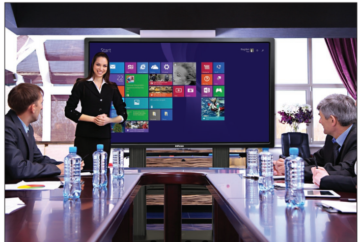
80" BigTouch (INF8012)