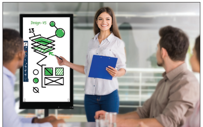
40" DigiEasel (INF4030)