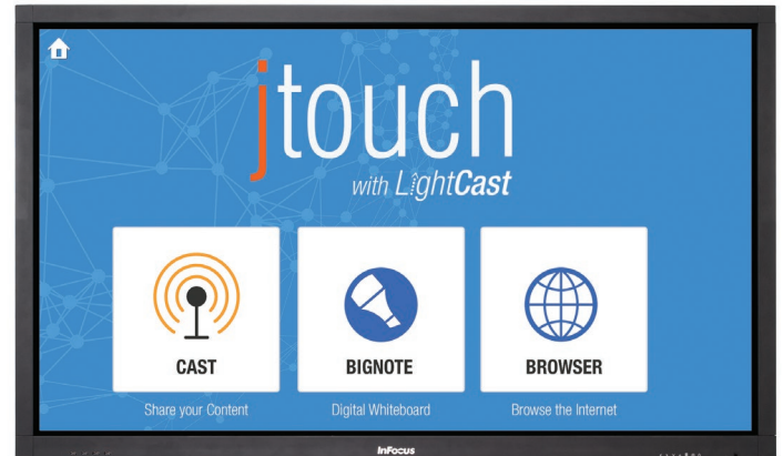
65" JTouch Whiteboard with LightCast (INF6501c)