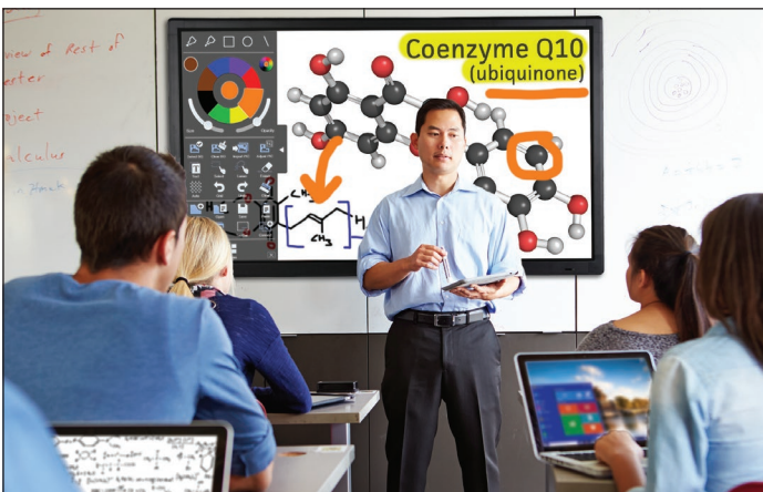
65" JTouch Whiteboard with LightCast (INF6501c)