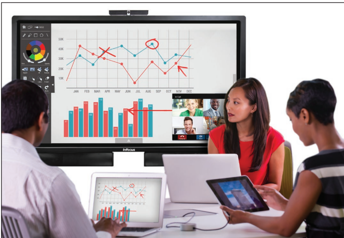
70" Mondopad (INF7021)