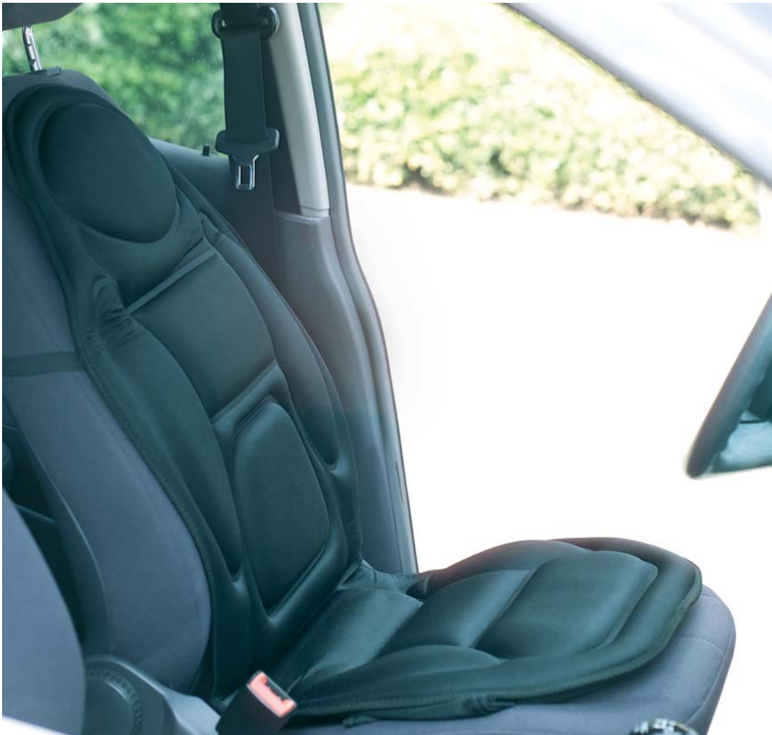
© Car Massage Mat KH 4105 Operating instructions