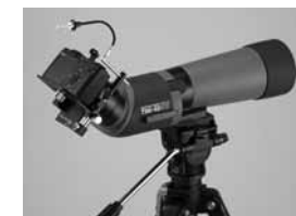
[ Digiscoping ]