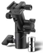
INSIGNIA Umbrella Bracket with Flash Mount NS-DUBR1S (NOT INCLUDED)