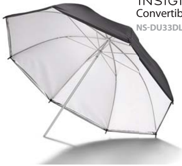
INSIGNIA Dual Layer Convertible Umbrella NS-DU33DL (NOT INCLUDED)