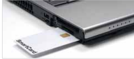
SmartCard Reader: enhanced security of systems and information through smart-card login features