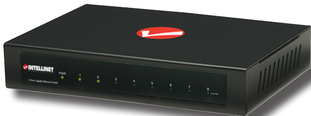
Shown: Model 530347, 8-Port