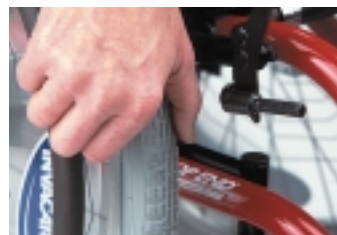
Thumb Saver Wheel Lock

Download from www.Somanuals.com . All Manuals Search And Download.