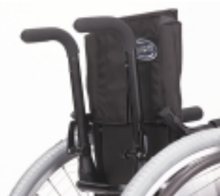
Adjustable height pushhandle with hide-away