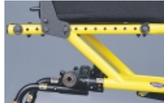
Adjustable seat depth, from 8"-16" with telescopic center-of-gravity adjustment.