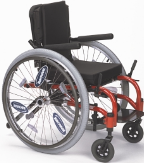
Invacare® Top End® Terminator™ Jr. Shown with optional cantilever arms, spokeguards and adjustable height push handles in their hide-away position.

The Invacare® Top End® Terminator™ Jr., is a pediatric chair built to grow. It is designed to maximize mobility while maintaining the most optimum wheel position for propulsion. The adjustable telescopic center-of-gravity, in combination with adjustable seat depth, allows for both growth and seating systems. There are three seat height settings for each wheel size so that the chair can grow from as low as 13" with an 18" wheel to as high as 18" using a 24" rear wheel. The adjustable height front casters will make seat height adjustments easy and quick. The flip-up footboard make tranfers easy and safe. It is the perfect chair for kids on the go!