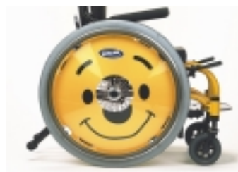
Three new choices available; Smiley (shown), Spider and Flowers (not shown).