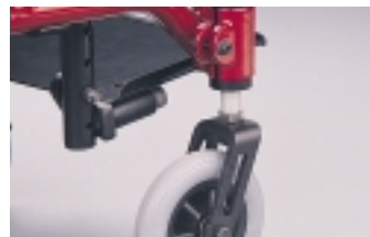
Adjustable height front casters.