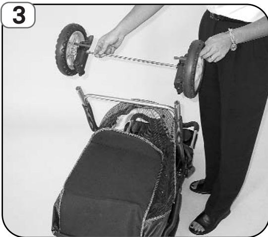
3 Turn the frame face down. Position rear axle assembly so brakes are pointed toward you. Push rear axle assembly firmly onto each leg so that the buttons "snap" into the holes in the wheel brackets.