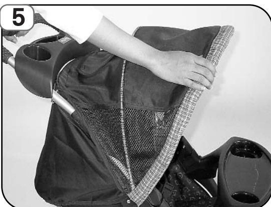
5 Adjust the canopy by lifting or lowering to desired positions.