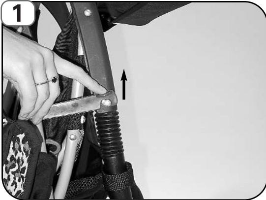
1 Lift storage clip.

When making adjustments to your stroller, always ensure that all parts of your child's body are clear of moving parts.