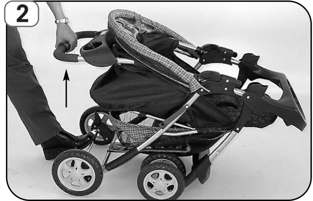
2 Place your foot on the rear frame tube and lift the handle until the frame locks snap into position.