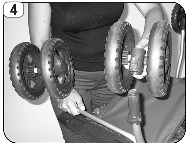
4 Position each front wheel assembly onto each of the front legs. Pull back on tab, slide into position and release tab. IMPORTANT! Pull firmly on all wheel assemblies to be sure that they are securely attached.