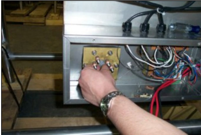
Removing silicone from thermostat well