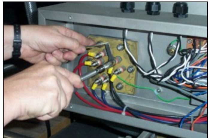
Tightening the nuts holding the power lines

16. Using the torque wrench or a torque nutdriver (if available) torque the nuts holding the wires, jumpers and bus bars to 16 in-lbs.