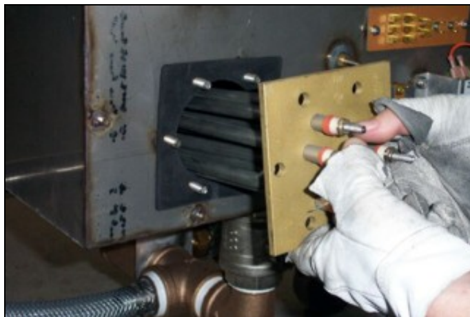
Removing the heater

8. Remove the heater from the tub weldment.