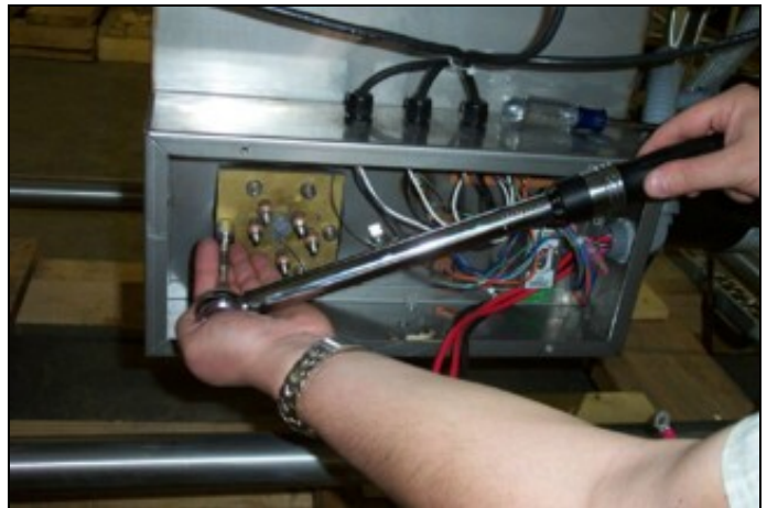
Applying the torque wrench to the nuts

12. Slide the heater onto the studs and apply by hand the lockwashers and nuts. Tighten the nuts by hand and then use the torque wrench set to 154 in-lbs to ensure that the nuts are secure.