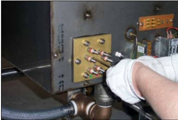
Putting the thermostat probe in the heater well

14. Apply silicone to seal the well and hold the thermostat probe in place.