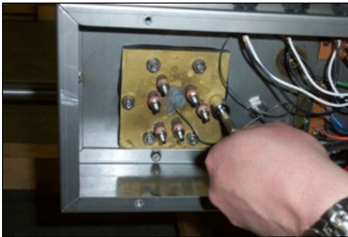
Removing the nuts and lockwashers

7. With the thermostat probe out of the way, use the 1/2" socket and ratchet to remove the nuts holding the heater to the tub. Remove all nuts and lockwashers.