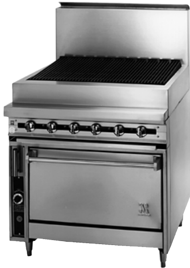
JTRH-36B-36 with optional high riser.