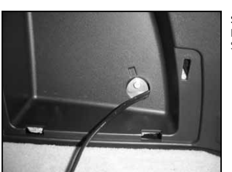
Run speaker wire from the amplifier location to the Stealthbox® location.

From the outside of the vehicle. Place the 3/8-inch drill bit through the pass through hole, enlarge the pilot hole.