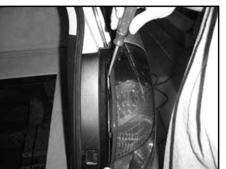
With a small flat blade, carefully pop off the black plastic trim from the passenger's side rear taillight.