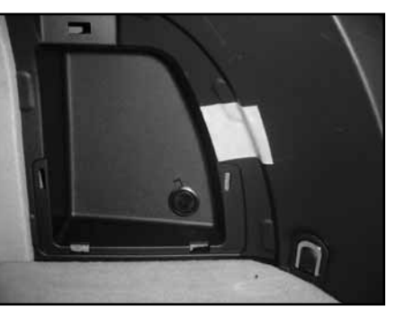
STEP 6 Apply the supplied wax square into place. The left side is lined up with the left edge of the pocket opening and above the emboss portion of the inner lower corner.