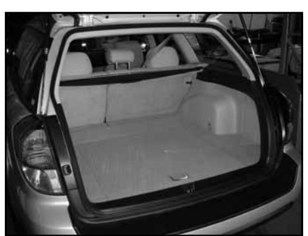
STEP 1 Remove all contents from the cargo area.