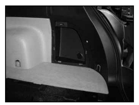
Remove the passenger's side rear pocket door and the separation wall.