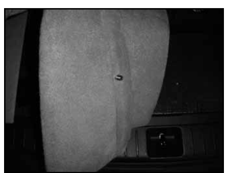
Thread the supplied socket cup set screw into the Stealthbox®, leaving 1/4-inch of thread exposed.