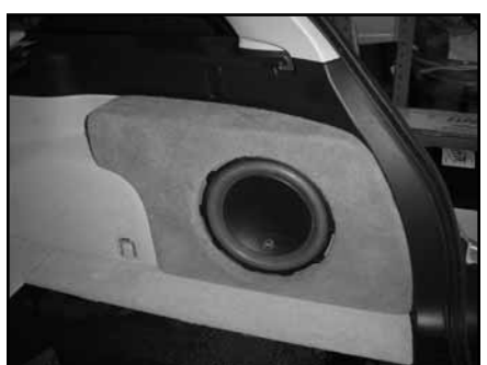
STEP 8 Position the Stealthbox® in the mounting location and press on it firmly.

Remove the Stealthbox® carefully, leaving the wax squares in place. The socket cup set screws will leave impressions in the wax.