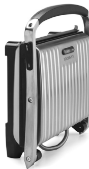
Fig 2 & 3

NOTE: For convenience the Kambrook Stainless Steel Grill may be stored standing in an upright vertical position (see Fig 3).