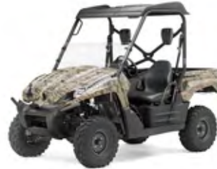
Realtree® Hardwoods Green® HD™