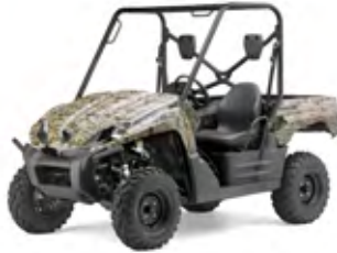
Realtree® Hardwoods Green® HD™