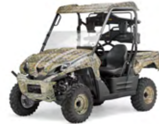
Realtree® APG HD™