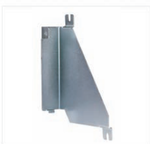
Panel Mounting Bracket

The industrial KCD-300 media converter series provides industrial strength Ethernet copper-to-fiber media conversion, allowing for 10Base-T-100Base-FX or 100Base-TX-100Base-FX over multi-mode or optional single-mode fiber optical media.