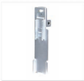
DIN Rail Mounting Bracket