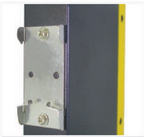
DIN Rail Mounting Bracket