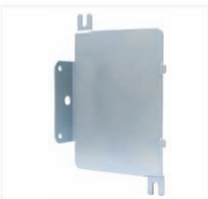
Panel Mounting Bracket