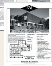
Mixed Text/Photo Mode

Various Imaging Modes capture every detail of your original with amazing results.