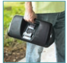
Portable audio system with integrated handle