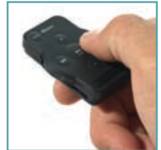
Wireless remote control