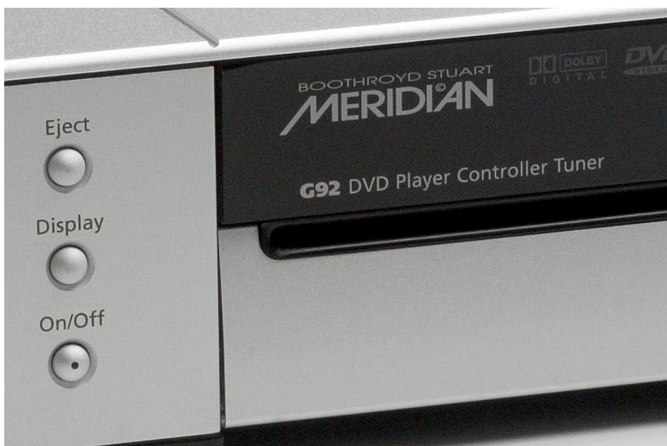
G92 features a slot-loading DVD-ROM drive

The HDMI output can be connected to a DVI input if the device supports HDCP copy protection, using a suitable adaptor cable.