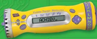
Turbo Twist™ Spelling 6 years & up

Arcade games teach core spelling words and definitions... on the go!