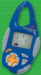
Mind Mania™ Math Clip 7 years & up