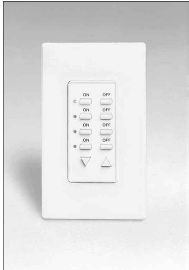
Cat. No. HXC4D-1TW