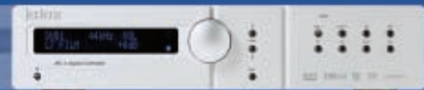
GX-7 Power Amplifier shown with MC-4 Digital Controller

The ZX-7 & RX-7 feature true balanced topologies. This approach results in lower noise, lower distortion, and eliminates interference from external stray electronic fields. Music reproduction benefits from a cleaner soundstage and increased dynamics, while the presentation of subtle detail is improved appreciably due to the significantly lower noise floor. Designed for the enthusiast, Lexicon power amplifiers are the perfect complement to our award-winning Digital Controllers & Disc Transports, and are ideally suited to power the world's finest listening systems.