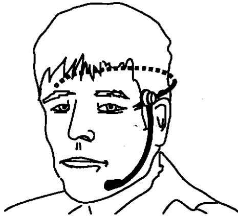
Figure 9 Headset Microphone Positioning

3. Noise-cancelling headset microphone. The headset microphone is placed from behind the head over both ears (It is like putting a pair of glasses on backwards). The microphone gooseneck boom is then adjusted to come down along the jaw line with the microphone element positioned about 3/4" from the chin. as shown in Figure 9.