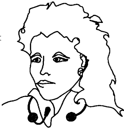
Figure 7 Collar Microphone Positioning

2. Lapel Microphone. Attach the lapel microphone with clothing clip to clothing directly below and within 4" inches of the chin as illustrated in Figure 8.