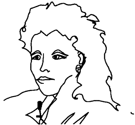
Figure 8 Lapel Microphone Positioning

3. Noise-cancelling headset microphone. The headset microphone is placed from behind the head over both ears (It is like putting a pair of glasses on backwards). The microphone gooseneck boom is then adjusted to come down along the jaw line with the microphone element positioned about 3/4" from the chin. as shown in Figure 9.