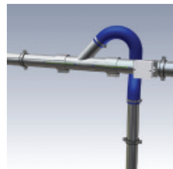
Shown: Easy-Duct System