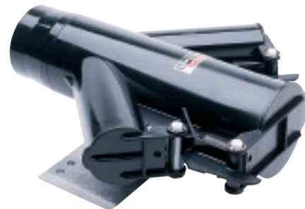
Shown: Distribution & Shutoff Valves