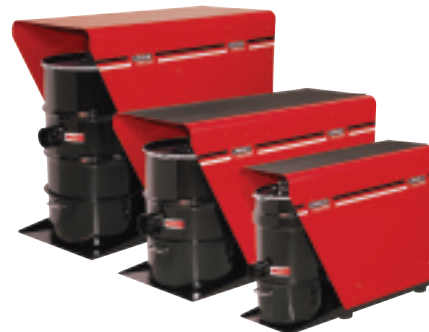
Shown: Back view