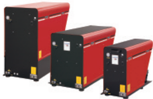
Shown: Front view

Since the hoses and suction nozzles are smaller than those of low vacuum systems, it is much easier to carry the fume gun, extraction nozzle and/or flex hose into confined spaces depending on the type of welding, base material, consumable used, and length of time. The mobility of the suction devices allows the main filter unit to be kept at a central location. Due to the low air volume (CFM) extracted, make-up air and negative room air pressures are kept to a minimum when exhausting outside the facility.