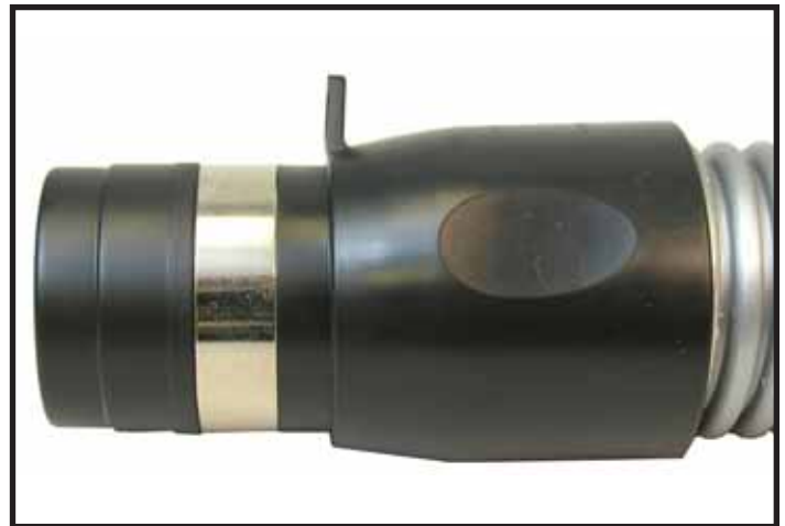
V222 New Style Cuff