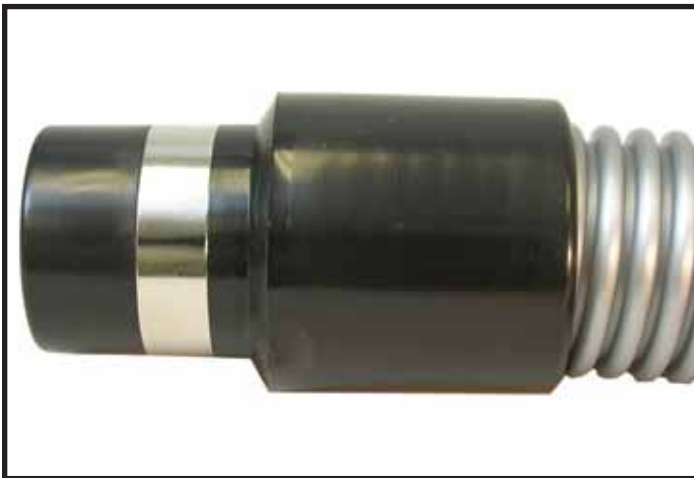
V222 Old Style Cuff

To identify the old and new hose cuffs, see the photos below.