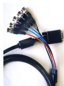
HD-15 Cable (Not Supplied)

LINK ELECTRONICS, INC. 2137 Rust Avenue Cape Girardeau, MO 63703-7668 Phone 573 334 4433 FAX 573 334 9255