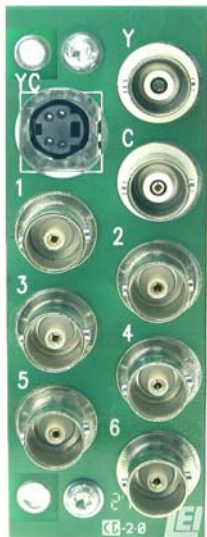
REAR CELL 1060

Height: ..... 3.2 Inches Width: ..... 1 Inch Length: ..... 10 Inches Weight: ..... 8 Oz