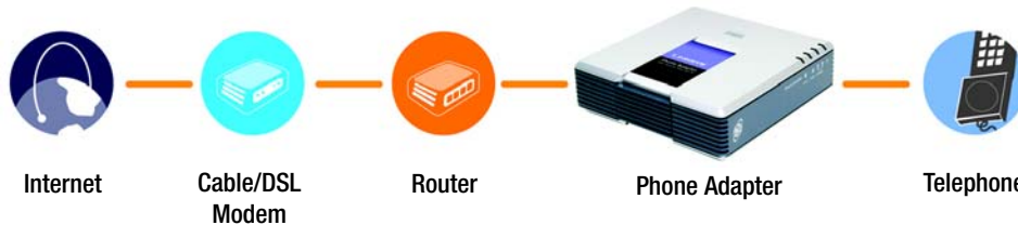
Figure 3-1: Connect the Phone Adapter to Your Network and Telephone

This chapter gives instructions on how to connect the Phone Adapter to your network and telephones or fax machines. Shown below is a connection diagram displaying a typical setup.