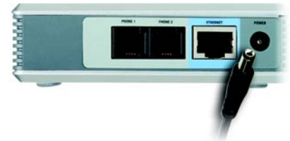
Figure 3-4: Connect the Power