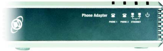
Figure 2-2: Front Panel

The Phone Adapter's LEDs are located on the front panel.