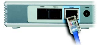
Figure 3-3: Connect the Ethernet Network Cable