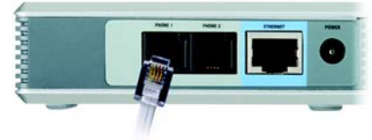
Figure 3-2: Connect the Telephone Cable

Proceed to the next section, "Placement Options," if you want to attach the Phone Adapter's base.