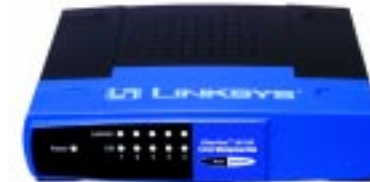
(EFAH05W v2 shown)