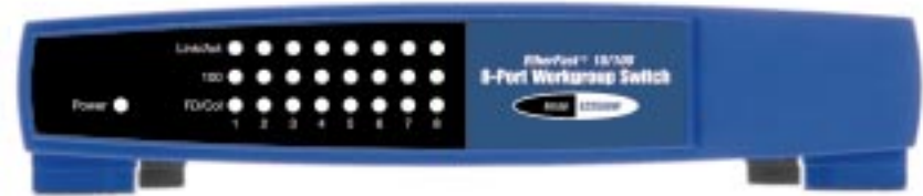
Front Panel - EtherFast 10/100 Workgroup Switch (EZXS88W v2 shown)

The chart below tells you what the front panel LEDs of the 10/100 Workgroup Switches mean. Each Switch has a Power LED on the left side to indicate when the unit is ON.