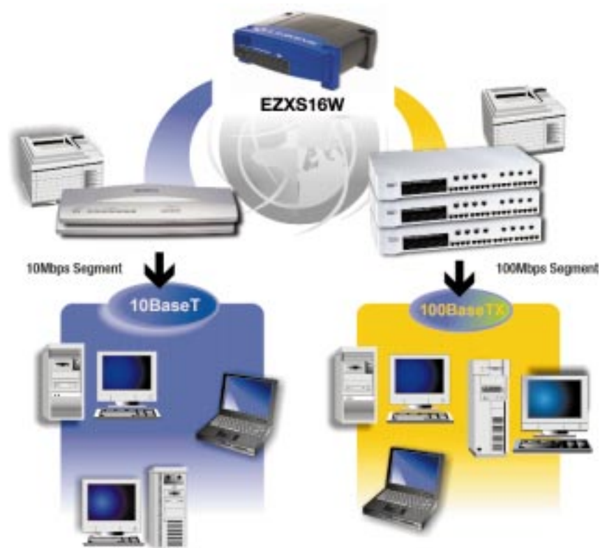
Configuration A (EZXS16W shown)