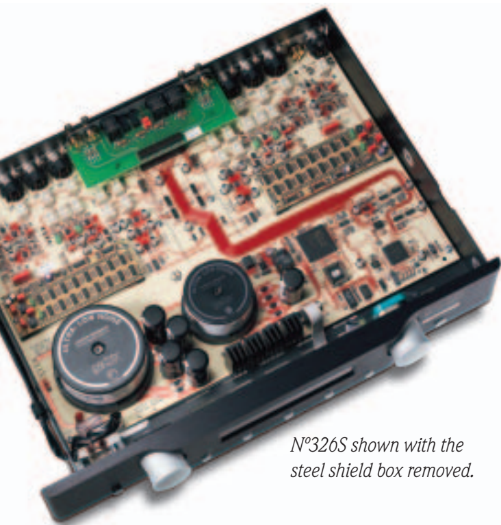
N°326S shown with the steel shield box removed.

The rear panel includes separate main and record output connectors, as well as two Link communication ports that make it possible for the N°326S to be included in Mark Levinson Link systems.