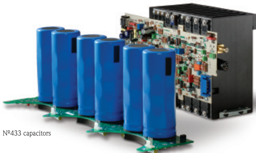
N°433 channel assembly

Specifications are subject to change without notice.