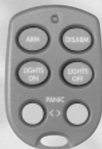
option KR21 art. no. 09169