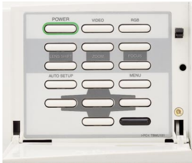
Control panel (Photo shows the PT-L6600E/L6510E. Controls of the PT-L6600EL/L6510EL are slightly different.)

The display resolution of the PT-L6510E/L6510EL is 1024 x 768 pixels. If the display resolution indicated in the above data does not match this resolution, the input signal will be converted to 1024 x 768 pixels.