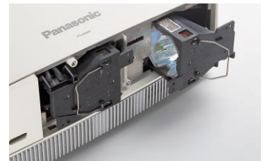
Lamps can be easily replaced.

a lamp without removing the projector from the bracket in either the ceiling-mounted or dual stacking configuration.