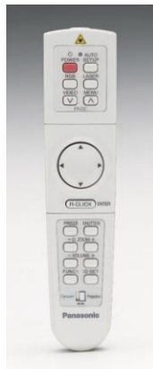
Wireless remote control