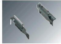
Rack Mount Adapter AJ-MA75P