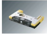
Cassette Adapter AJ-CS455P