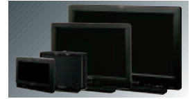
HD/SD LCD Monitor BT-LH80W, BT-LH900A BT-LH1700W, BT-LH2600W