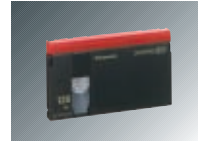
DVCPRO HD Cassette AJ-HP126EXG (126 min.)