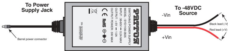
Figure 1. DC Power Supply

The 36-60 VDC DC to DC adapter is supplied with the DC version of the Model 3088. The black and red leads plug into a DC source (nominal 48VDC) and the barrel power connector plugs into the barrel power supply jack on the 3088. (See figure 1 ).