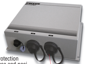
Shroud for RJ-45 provides protection against damage through misuse and positive alignment for mating of connectors

Built to NEMA 4 specs, the durable EH Series protects against rain, sleet, snow, dirt, dust, ice build-up, high humidity (moisture) and physical tampering. Able to operate in temperatures ranging from 32 to 122°F (0 to 50°C), it is ideal for use in environments with controlled temperatures.