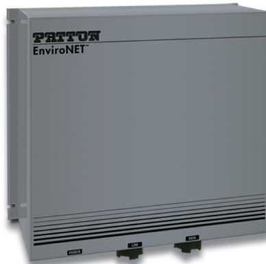
NEMA 4 self-sealing brass cable glands for network connections and power feeds

Visit www.patton.com for more information.