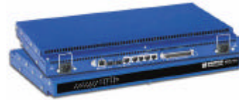
Model 3095 (Cross Connect)