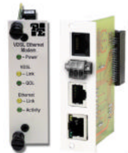
Model 1058DV and 1058DVRC