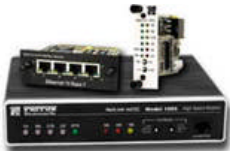
Model 1095 and 1095RC (Quick Connect)