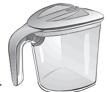
MR. COFFEE® TP50 Replacement Pitcher