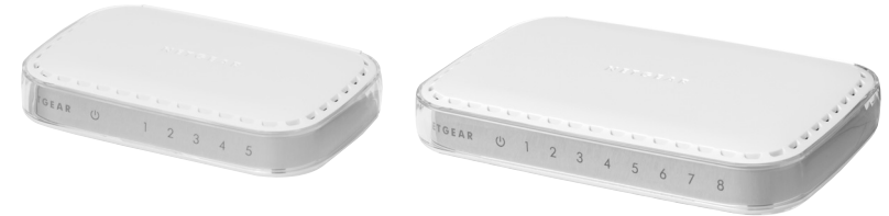
Fast Ethernet Switch FS605 v3/FS608 v3

The NETGEAR® 5/8-Port Fast Ethernet Switch Model FS605 v3/FS608 v3 provides you with a low-cost, reliable, high-performance switch to connect up to five or eight different Ethernet-enabled devices (such as computers, file servers, print servers, printers, routers and hubs).