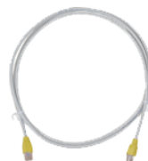
2M RJ45 CABLE