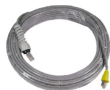
25M RJ45 CABLE