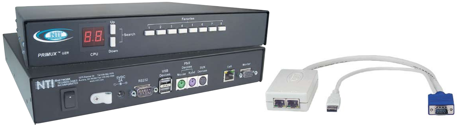
PRIMUX-UZR (Front and Back) and HA-USB Host Adapter

Control up to 64 servers in zero rack space