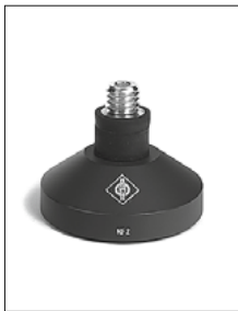
Table Stand MF 2

Small table stand with brass base, very sturdy. It has a black matte finish. The bottom is fitted with a non-slip rubber disk. The stand has a 1/2" threaded stud for mounting the SG 21/17 mt, for example. The rubber shock mount between the stud and the base serves to suppress structure-borne noise. Ø 60 mm, Weight 340 g.