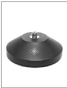
Table Stand MF 3

The MF 3 is a table stand with iron base, 1.6 kg in weight, 110 mm in diameter. It has a black matte finish. The bottom is fitted with a non-slip rubber disk. The stand comes with a reversible stud and an adapter for 1/2" and 3/8" threads.