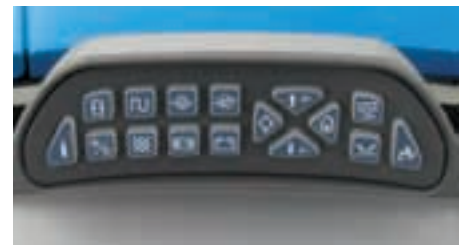
An enhanced performance monitor and radar are optional on all Plus and Elite models, allowing you to track and program a variety of functions including linkage height, PTO speed, hours, distance traveled and electronic remote valve status.