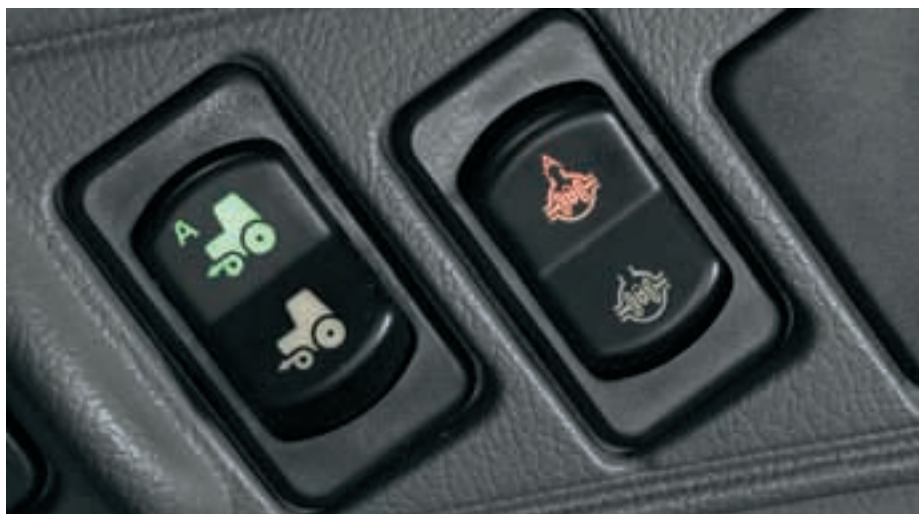
The TerraLock™ system automatically controls FWD and differential lock engagement to give you maximum traction and control.

Self-adjusting, self-equalizing hydraulic wet disc brakes deliver the stopping power you need. When both brake pedals are applied simultaneously, FWD engages automatically to aid in braking action for added control.