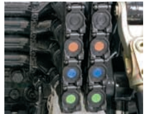
Hydraulic control levers and remote coupler dust covers are color-coded to assist with easy implement hook up and control.