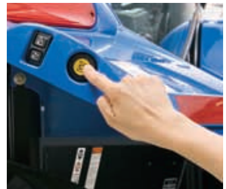
Quick-raise hitch switches are provided on both rear fenders on tractors equipped with electronic draft control. An exterior PTO switch is also optional on the rear fender of all cab models (except 12x12 transmission). Press the button for less than five second for a pulsing action that makes it easier to hook up the PTO shaft. Hold the button for longer than five seconds to fully engage the PTO.