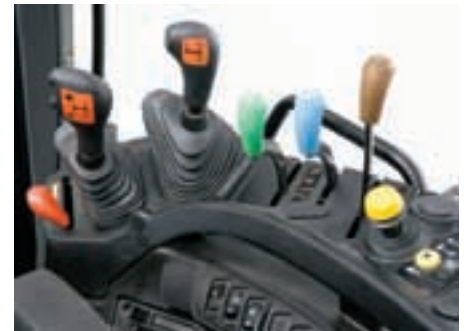
The 24x24 Dual Command transmission doubles your gears from 12 to 24. Underdrive button on the side of the shift lever and on the console (B) allows you to powershift on-the-go without clutching.

and reduces tractor speed by approximately 22%. Dual Command buttons are located right on the gearshift lever to allow you to powershift on-the-go without clutching. Use the lower button (tortoise) to engage the underdrive. Push the upper button (hare) to disengage Dual Command and return to direct drive. This transmission provides the benefit of up to 11 speeds in the two- to eight-mph working range for maximum versatility. Transport speed is 30 km/h for 2WD models and 40 km/h for FWD models.