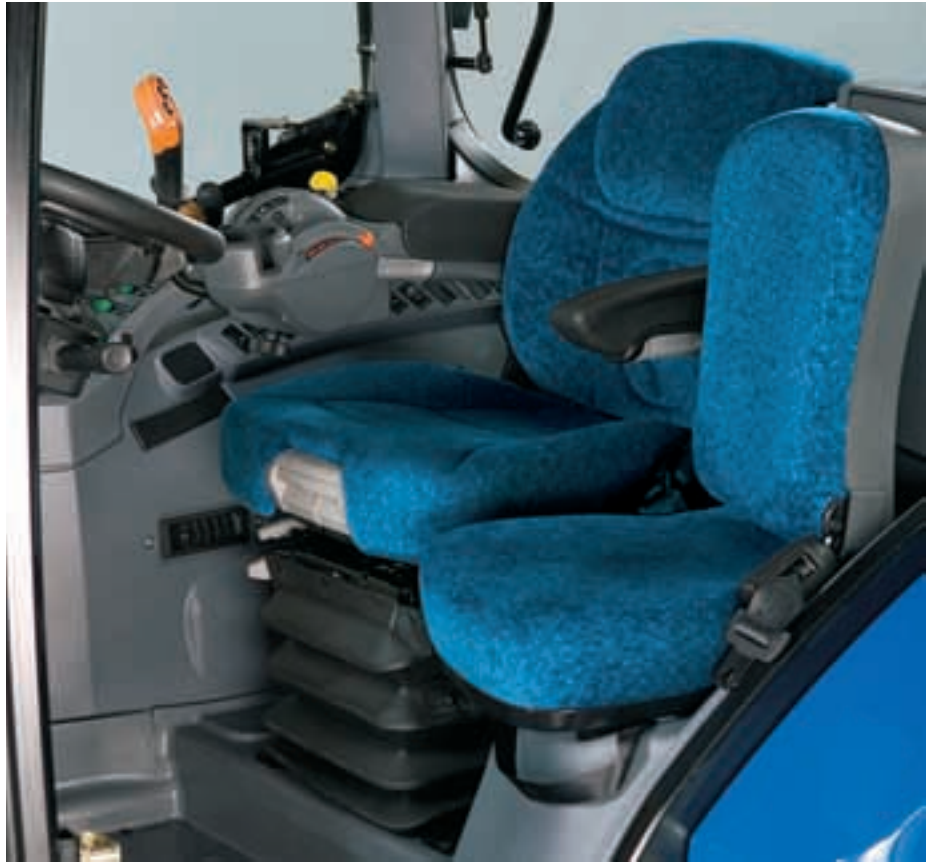
A comfortable, supportive, full-size instructor seat is a Horizon cab option.

For the absolute smoothest ride over bumpy ground, choose the Comfort Ride™ Cab Suspension option available on Plus and Elite models. This simple mechanical system is always on. Two isolation "donuts" at the front corners of the cab and a swaybar and two shock absorbers at the rear isolate you from up-down motions and side-to-side swaying.