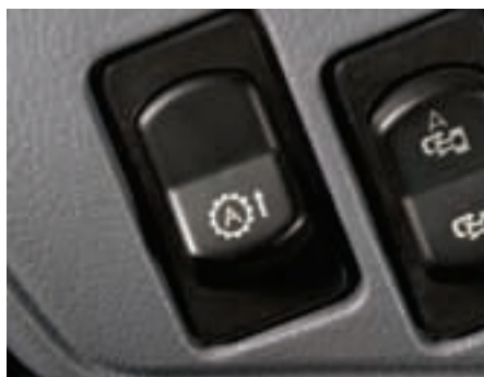
Just press the "Auto" button, and the Power Command™ transmission automatically shifts up or down within a span of gears based on engine RPM and applied flywheel torque.