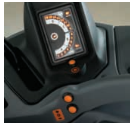
AutoShift™ transmissions provide automatic shifting in the field or one the road. You program the shift point and shuttle preferences.

even more time-saving features. Push the "Auto" button while operating in the field, and the AutoShift transmission does the shifting for you within the four gears of Ranges A (Gears 1 to 4), B (gears 5 to 8) or C (Gears 9 to 12). When roading, press the AutoShift button once to shift as needed within Ranges C or D; press the AutoShift button twice to move freely from gear 9 through gear 16 and back down as needed without stopping to shift