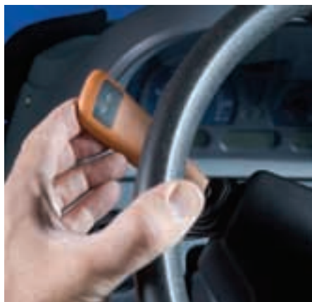
The clutch-free power shuttle is electro-hydraulically engaged and located to the left of the steering column for easy fingertip control.