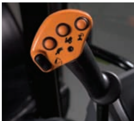
The convenient seat-mounted multi function controller gives you complete transmission control on Power Command equipped models.

A 19x6 Power Command™ transmission provides an additional forward speed that allows T6000 Elite tractors to achieve a higher 50 km/h speed (tire restrictions apply).