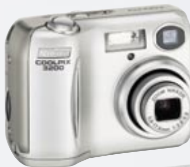
COOLPIX 3200 3.2 Effective Megapixels