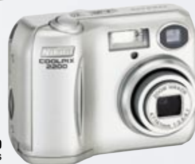
COOLPIX 2200 2.0 Effective Megapixels