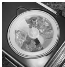
ILLUSTRATION B Ice Feed Canister with ice