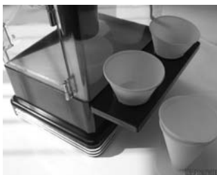
ILLUSTRATION D Showing designed use of cone shelf and Plastic cone holders. (Paper cones not Included)

Whatever you create, we are sure the RETRO SNOW CONE MACHINE™ will make it fun for the whole family!