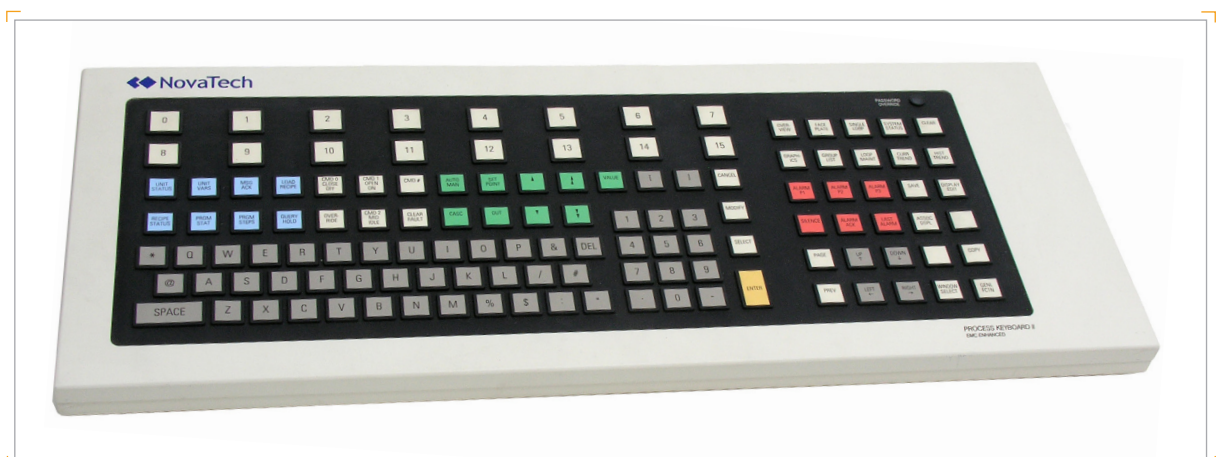
D/3 USB Keyboard

See Operator Console User's Guide for additional information about the D/3 Keyboard functions.