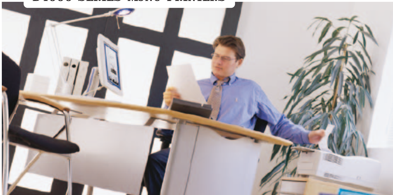
B4100: Personal printing for professionals

Mono printing is the engine room of a smooth running business, the unsung hero powering through the workload.