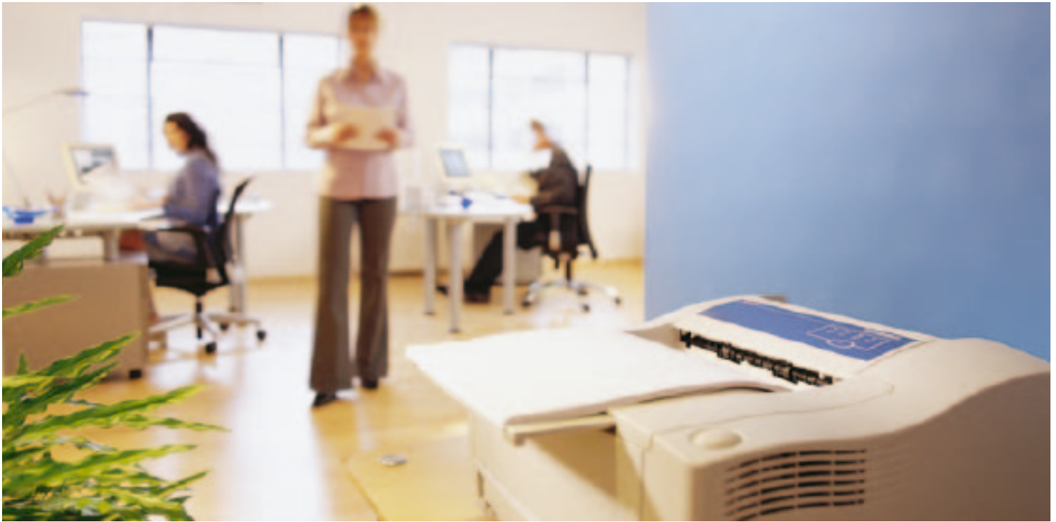
B4250: High-speed personal printing for professionals