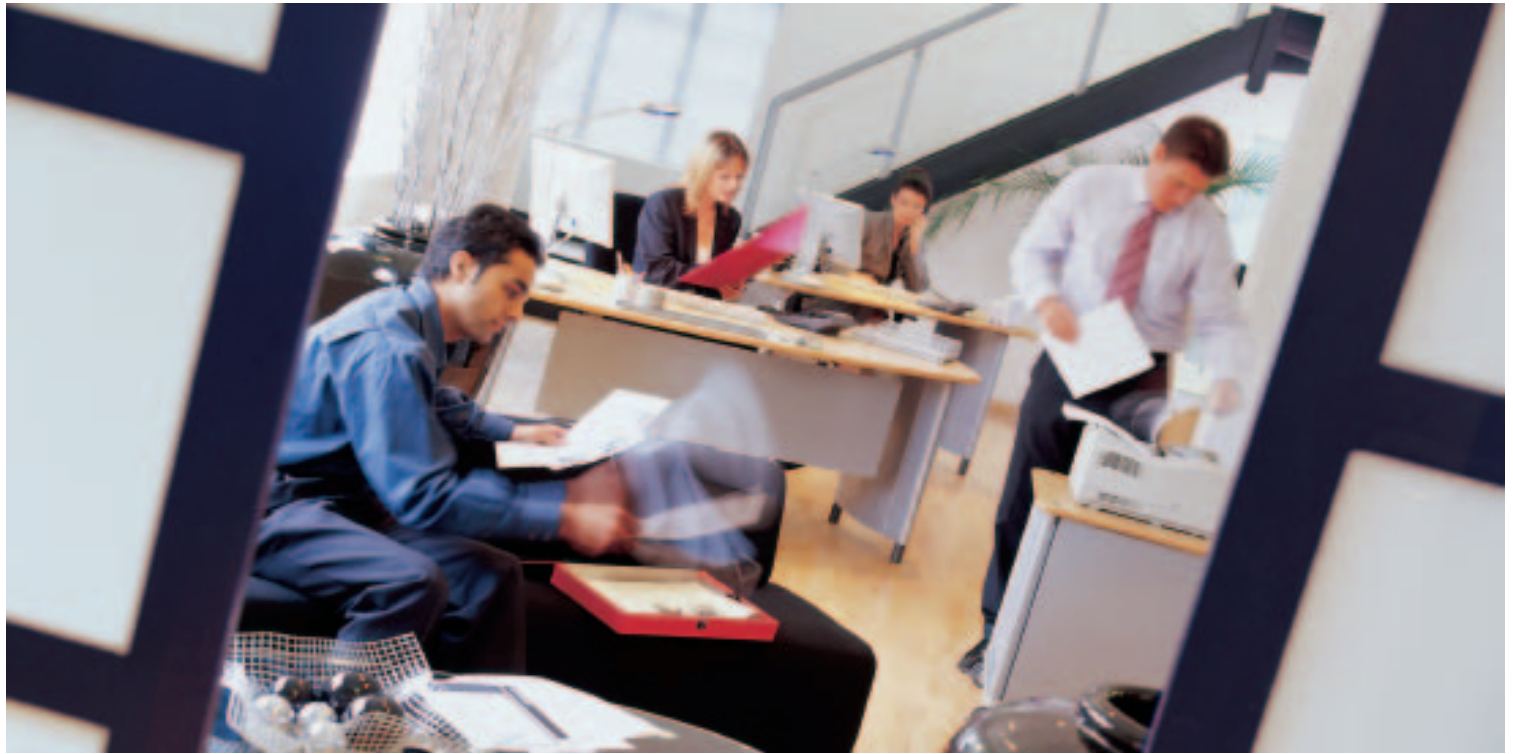
B4350: Reliable, high-speed professional printing for personal and very small workgroup users

The B4250/B4350 have options for networking and upgrades, so you'll find the B4000 Series can be specified to meet your requirements, precisely. Our printers excel in all areas affecting workplace productivity. Choose your printer and its particular benefits based on the specification requirements for your business.