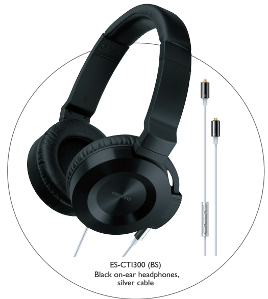
ES-CTI300 (BS) Black on-ear headphones, silver cable