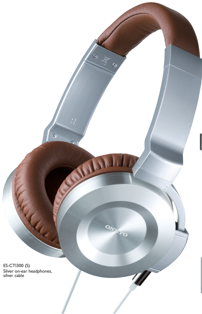
ES-CTI300 (S) Silver on-ear headphones, silver cable