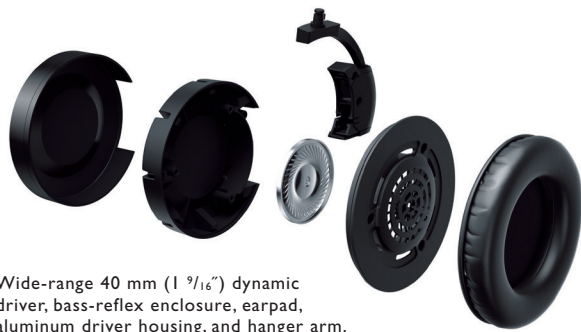
Wide-range 40 mm (1 9/16") dynamic driver, bass-reflex enclosure, earpad, aluminum driver housing, and hanger arm.